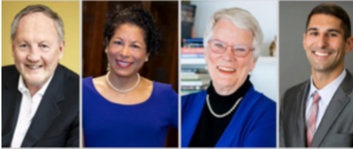
Annual SURN Leadership Conference