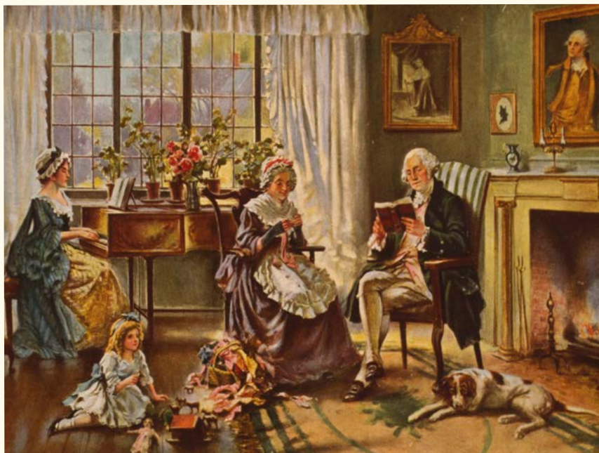
Washington at Home by E. Percy Moran (1911).