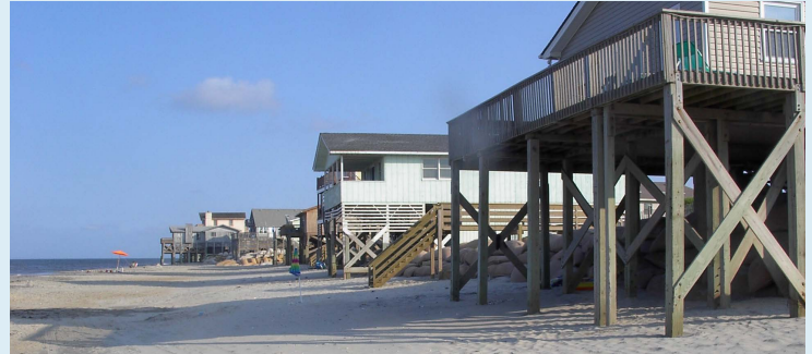
Oceanfront houses in Virginia Beach are vulnerable to severe storms, flooding, and coastal erosion.

Sea level is rising more rapidly along Virginia's shores than in most coastal areas because the land is sinking. If the oceans and atmosphere continue to warm, sea level along the Virginia coast is likely to rise sixteen inches to four feet in the next century.