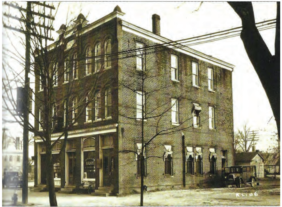
Scene of the crime: Peninsula Bank on DOG Street, Williamsburg, circa 1906

Did Betsy Ross really create the first American flag? Did Washington really chop down a cherry tree?