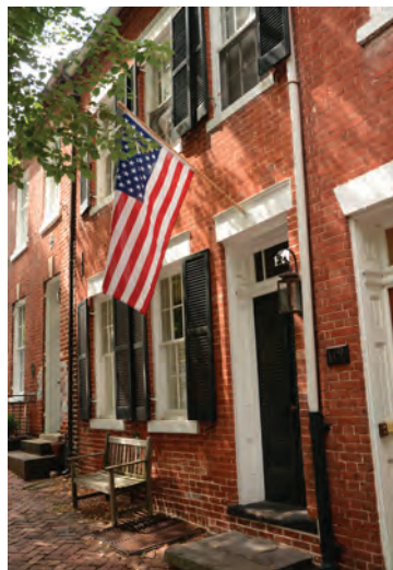
Old Town, Alexandria, Virginia

The reclusive (at least until he was interviewed by Oprah in 2007) Cormac McCarthy is considered by many critics as America’s greatest living author. He has published novels in multiple genres and styles from 1965-2022.