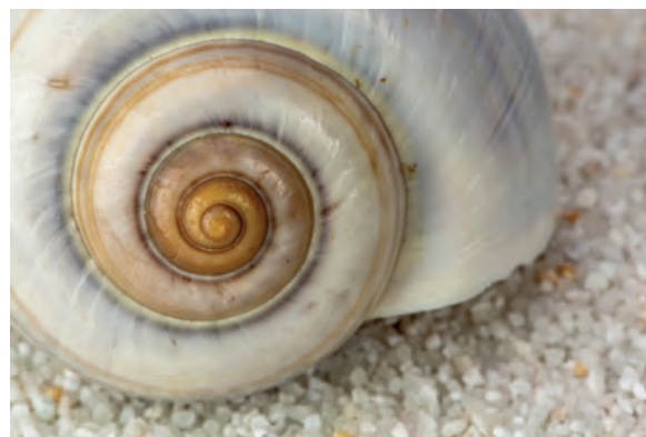
The Golden Ratio in nature (above) and in theory (below)