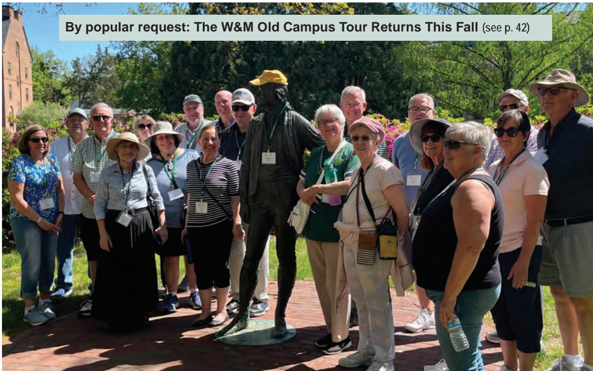
During the April 2023 Old Campus walking tour, an Osher class struck a pose with Thomas Jefferson on the occasion of his 280th birthday.