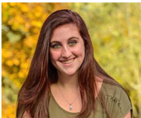
Chamberlin Higher Education Recruitment Award