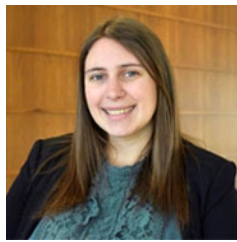
Chamberlin Higher Education Recruitment Award