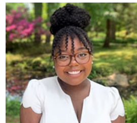
Chamberlin Higher Education Recruitment Award