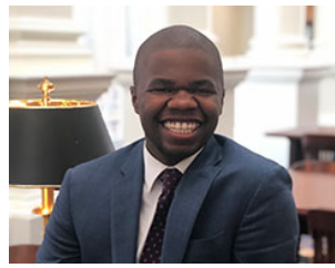
Chamberlin Higher Education Recruitment Award