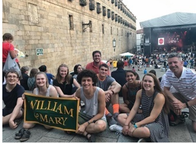
Students on the 2017 Camino de Santiago Trip